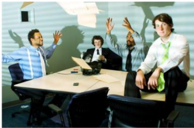
with special guests Photo from their debut album, Already Free