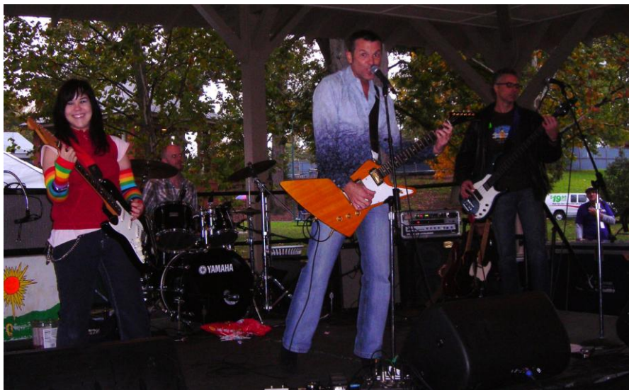
Left: The Armorettes